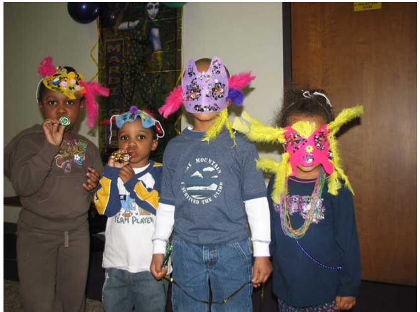
Fun Times for All

One of the most important things for any library program is to be informative, but no one said you can't have a lot of fun too. This kind of community family program is the best of both worlds: enjoyable and educational, for everyone!